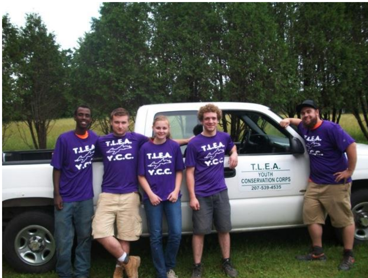
Thompson Lake Environmental Association